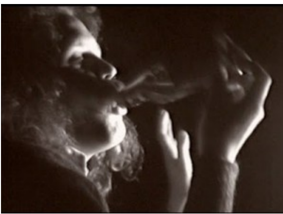
William Eggleston, 'Stranded in Canton', 1973, video, 77 mins