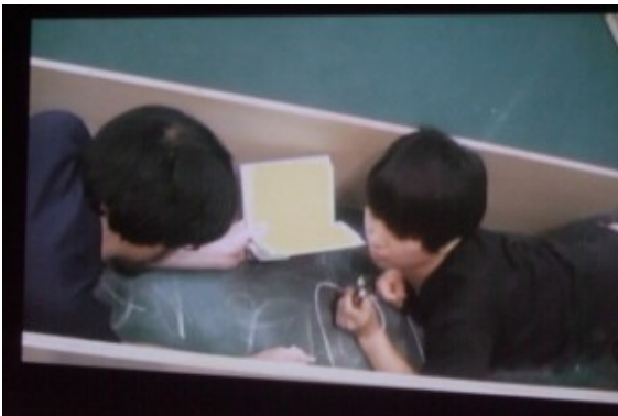
Taro Izumi, 'Corset (library)' (detail), 2012, video and timber construction