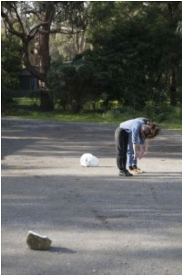
Eliza Dyball, 'Conformation in three parts', 2013