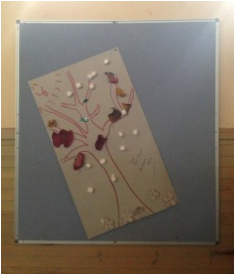
'Our Joey Scout Huturn Tree' on the Scout Hall pinboard