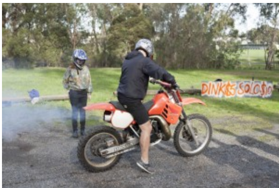
Lane Cormick, 'Only one way out of here', 2007-13