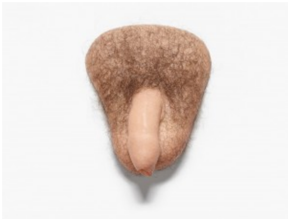
Simon Zoric, 'Cock & balls', 2013, silicone and crepe hair