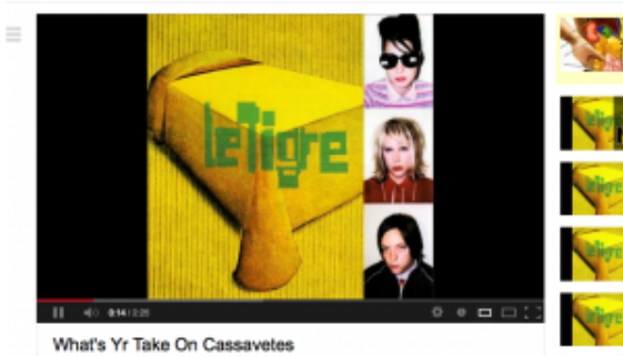
Screen shot, YouTube, Le Tigre, 'What's your take on Cassevetes'