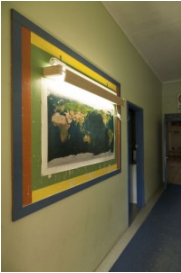
Daniel Bellfield, 'Map', 2013