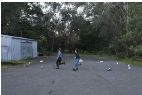
Eliza Dyball, 'Conformation in three parts', 2013