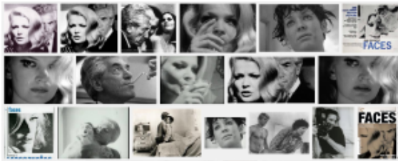
Screen shot, Google search for Cassevetes faces

The big east , 3rd Heathmont Scout Hall, Melbourne, 9 June 2013.