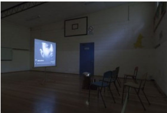
Kiron Robinson, 'When I write I write for you', 2013, DVD