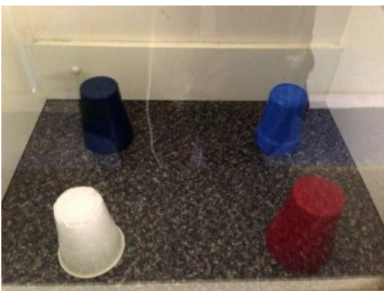
The cups in the 3rd Heathmont Scout Hall cabinets