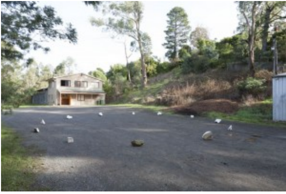
Eliza Dyball, 'Conformation in three parts', 2013