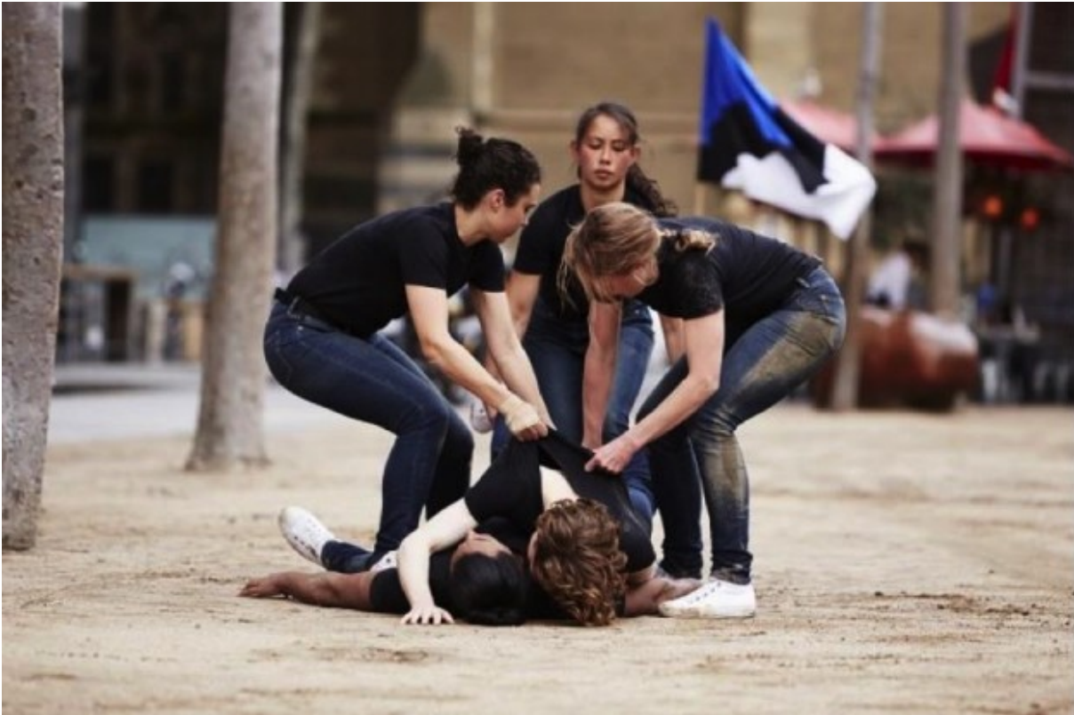
Public Movement: Training Ground, ACCA in the City, Melbourne, 2015

We know there is nothing like an injury to remind us of the material consequences of a game, combat or marginalization, but how are these principles or beliefs impacted when the audience become participants or performers in public? Do the audience's bodies become symbolic? Are they camouflaged by the artist's politic? Is the artist's methodology all-enveloping as a skin for the audience to try on? How much movement can skin generate and is it resilient enough to hold the participants' ghosts? Is there any autonomy for the body of the participatory audience?