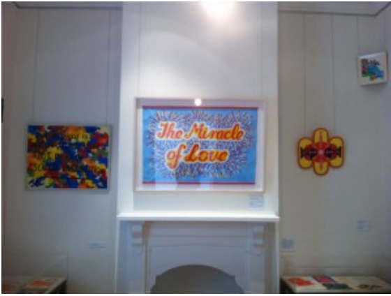
'The sometimes chaotic world of Mike Brown', 2013