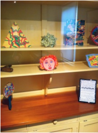
'The sometimes chaotic world of Mike Brown', 2013